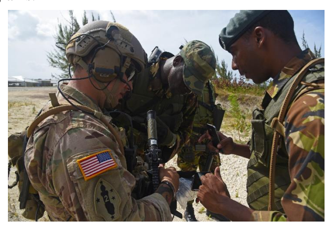
U.S. Army National Guardsman with Barbados Defence Force members during a USSOUTHCOM-sponsored Tradewinds Exercise June 8, 2017.

We regularly promote jointness in annual multinational exercises. Last year we supported the Dominican Republic's creation of a professional NCO Corps, South America's first-ever Senior Enlisted Conference, and continued regional leadership on effective gender integration in military and security forces and peacekeeping