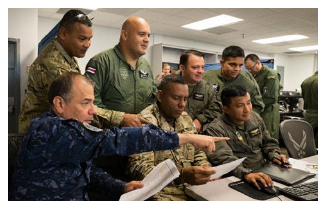
Service members from partner nation air forces work together during PANAMAX Aug. 14, 2017. The week-long exercise focused on security of the Panama Canal.

economic initiative—and the continued provision of financing and loans that appear to have 'no strings attached' provide ample opportunity for China to expand its influence over key regional