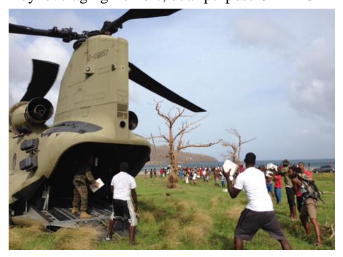
The DOD distributes USAID relief supplies in Dominica Sept. 27, 2017.

multinational organizations. The return on this investment was evident in 2017, with CDEMA, CARICOM, and the RSS playing critical roles in the regional response effort to Hurricanes Irma and Maria, and multiple nations providing assistance to their Caribbean neighbors. For our part, by leveraging flexible, dual-purpose SPMAGTF forces already in the region, we were able to