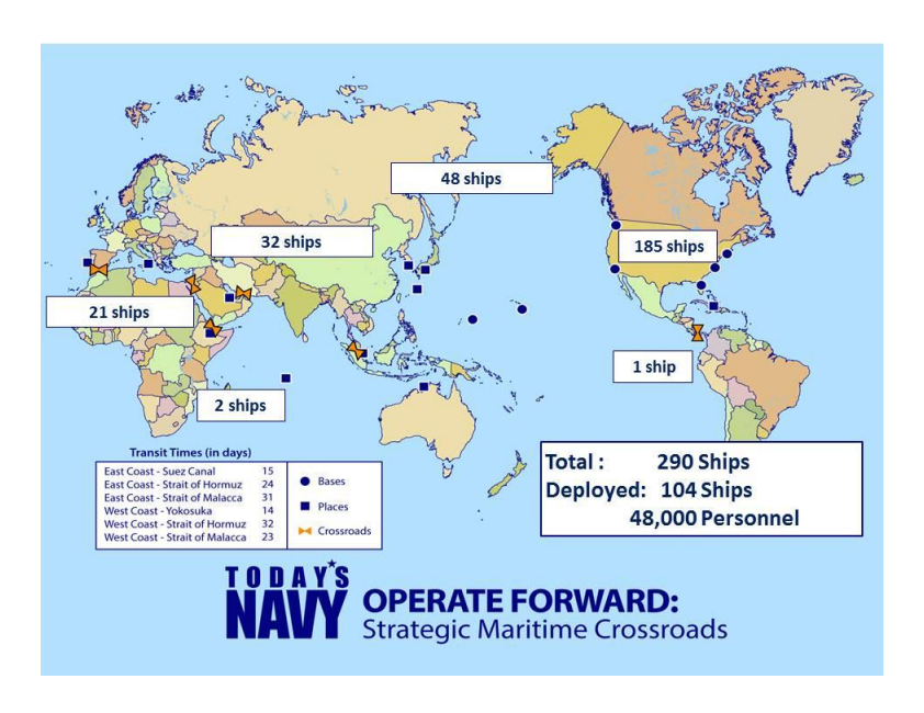
Figure 1: The Navy's forward presence today.

As the chartlet below shows, 104 ships (36% of the Navy) are deployed around the globe protecting the nation's interests. This is our mandate: to be <u>where</u> it matters, <u>when</u> it matters.